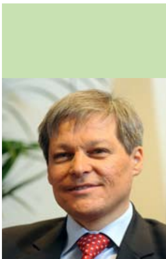
Dacian Cioloș EU Commissioner for Agriculture and Rural Development

It is not by mistake that the ancient Greeks put agriculture under the patronage of a female deity. Demeter was the goddess of agriculture, horticulture, grain and harvest. She was the keeper of the horn of plenty. It is not by mistake that there was another goddess, her daughter, Persephone, associated with the spring, with the seeds and the fruits of the fields, with the cycles of vegetation, which shoots forth in the spring and withdraws into the earth after the harvest. And there is not by mistake that another goddess, Athena was the deity for wisdom and reason!